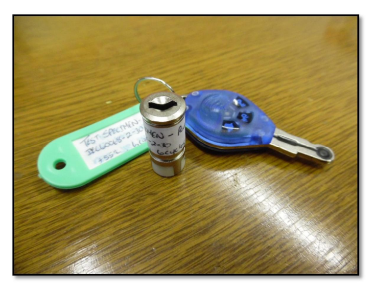
Plug and Key