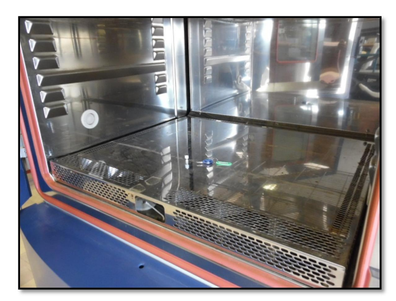
The Plug and Key inside the chamber during the damp heat test