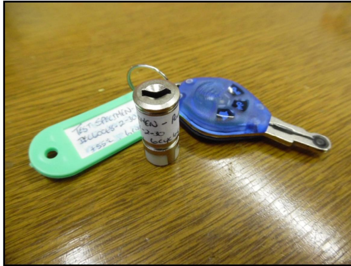
Plug and Key