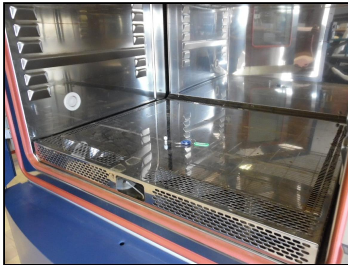
The Plug and Key inside the chamber during the damp heat test